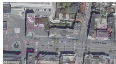
(Mertens K., 2022).

To pass the course, a participant is required to complete assignments for at least two of the four modules.